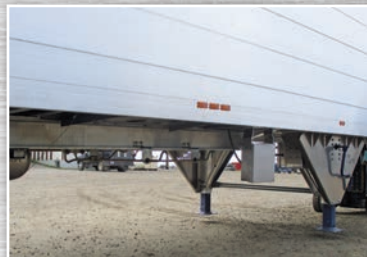
All Aluminium Chassis