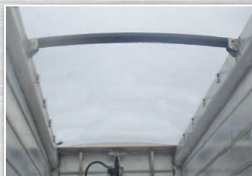
Single Top Crossmember