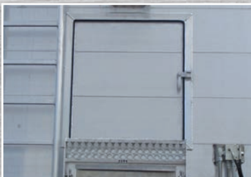
Front Man Door with Fold Down Step