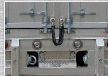
D-Ring Style Tow Hooks