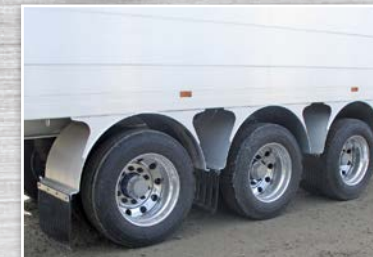
Full Fenders Over Primaries with Short Flap