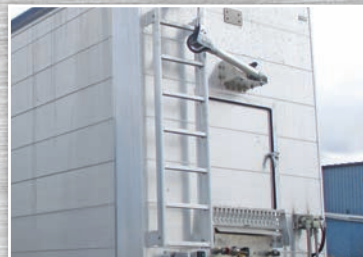
Front Driver Side Ladder